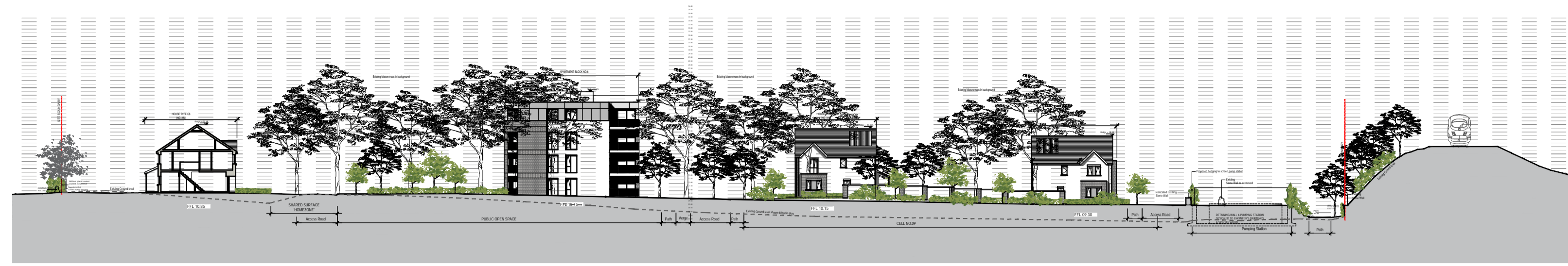
01 Site Context Elevation G-G Scale: 1:500