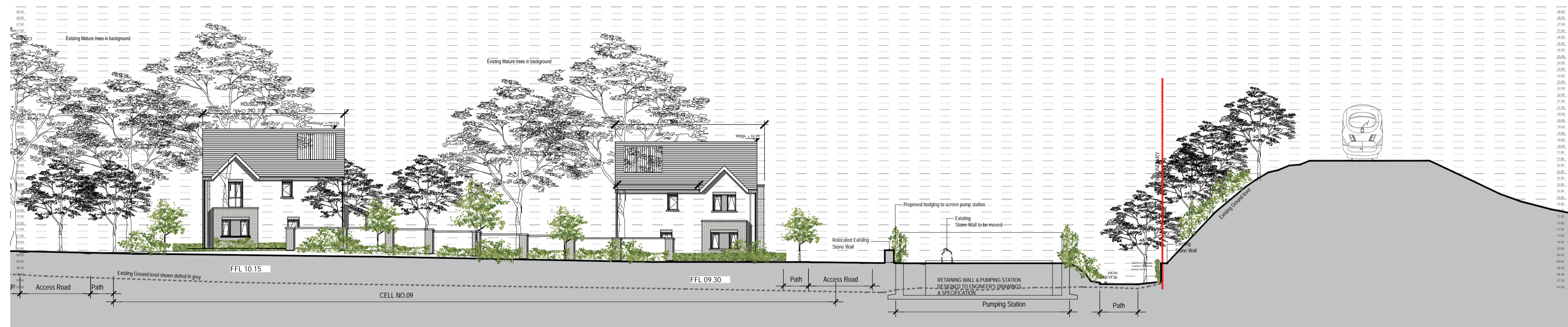
03 Site Context Elevation G-G Part 2 Scale: 1:200